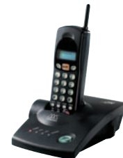
The Wanderer – 2.4GHz Cordless Handset