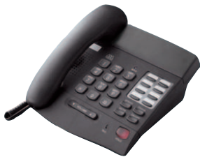
8-Button Enhanced Speakerphone