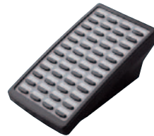
DSS Attendant Console