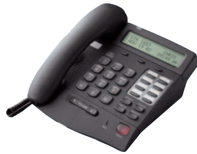
8-Button Executive Display Speakerphone