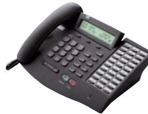
30-Button Executive Display Speakerphone