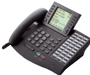
Elite Large Screen Display Phone